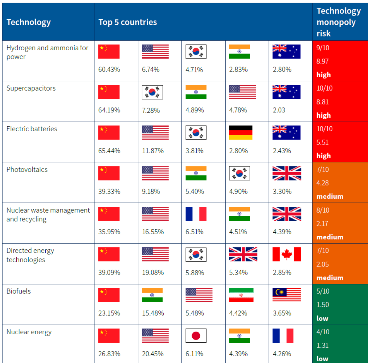
Table 2. Top 5 countries in various energy and environment categories.