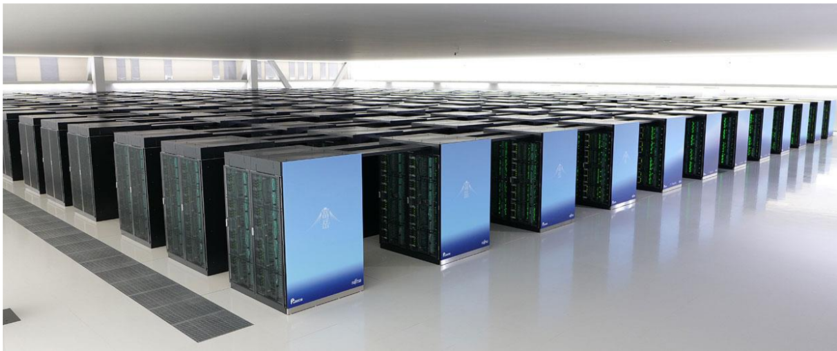
Figure 3. The Fugaku supercomputer facility at RIKEN Center for Computational Science (R-CCS) in Kobe, Japan.

Fujitsu claim their CPU is the world's first CPU to adopt Scalable Vector Extension —an instruction-set extension of Arm v8-A architecture for supercomputers. The 512-bit, 2.2-GHz CPU employs 1,024-gigabytes-per-second 3D- stacked memory and can handle half-precision arithmetic and (single-precision) multiply-add operations that reduce memory loads in AI and deep-learning applications where lower precision is admissible. The CPUs are directly linked by a 6.8-GB/s network Tofu D interconnect that uses a 6-dimensional mesh torus connection .