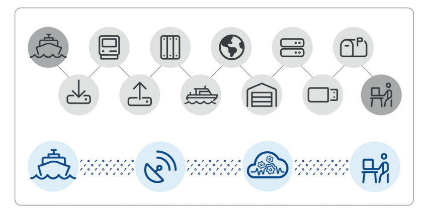
Figure 1 Traditional data flow (top) vs. optimised data flow (bottom). The traditional flow contains many data duplications and physical data handover points. The PGS optimised data flow transfers the subsurface information as soon as possible via satellite into the cloud for QC, processing and final delivery.

The projects have had a transformational impact on the organisation and impacted all parts of PGS. We started to work on new