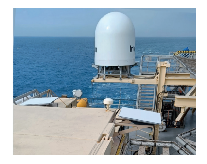
Figure 2 Left, LEO and GEO orbits relative to earth. Right, Starlink (front) and VSAT dome (back) satellite antenna on board the PGS vessel Vanguard.